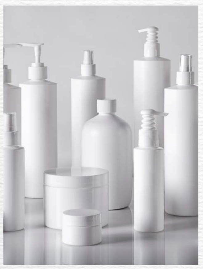
Plastics Top Cut Size: 10 – 20 μm