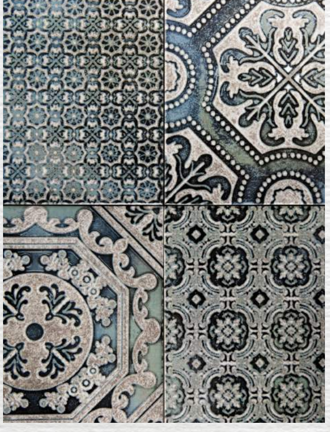
Ceramics Top Cut Size: 60 – 75 μm