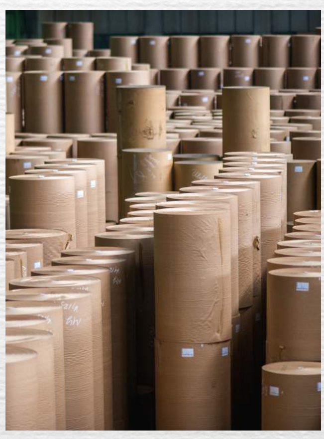
Papers Top Cut Size: 8 – 35 μm