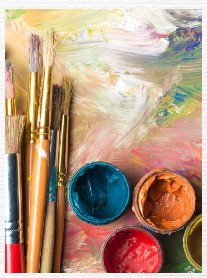
Paints Top Cut Size: 8 – 10 μm